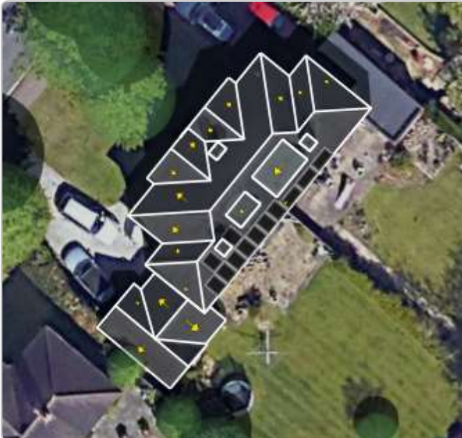
Zoomed out satellite view